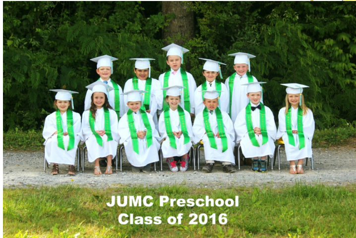
JUMC Preschool Class of 2016