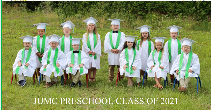
JUMC PRESCHOOL CLASS OF 2021

CONGRATULATIONS JUMC PRESCHOOL GRADUATES