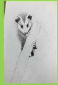
Student drawing example

Learn basic drawing techniques at "No Cost". Sponsored by the Jasper United Methodist Church, the class will be held July 11th from 9 AM to 1 PM in the church classroom.